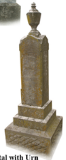
Pedestal with Urn