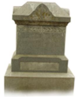
Die on Base with Cap