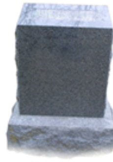
Die on Base